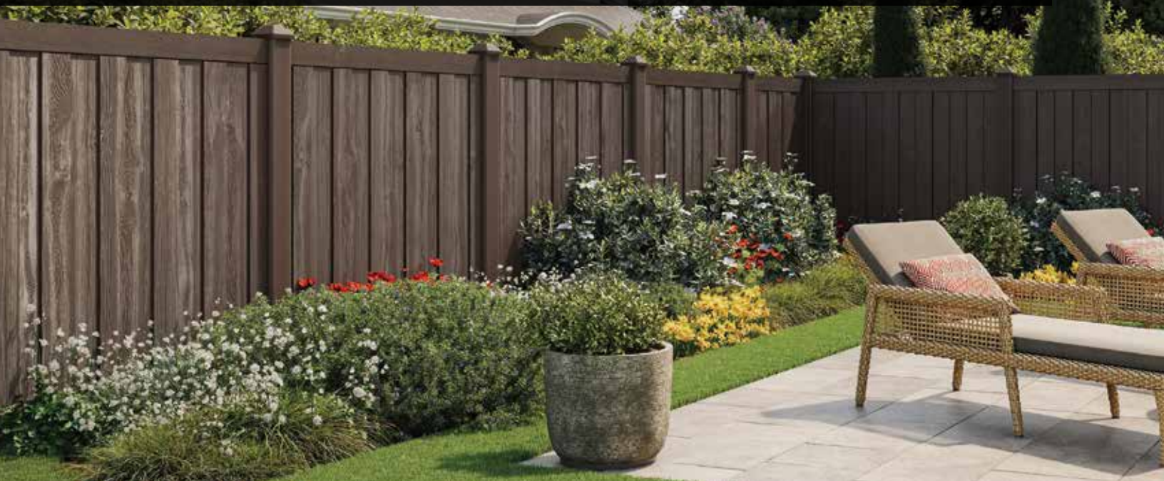
Shown in Walnut Brown

The beauty of nature is reflected in four detailed woodgrain finishes that resist impact and high winds. These hefty molded panels provide a realistic wood look and are a great solution for reducing noise and adhering to strict pool codes.